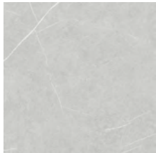
LIGHT GREY 35"x35"