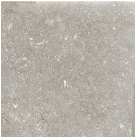
GREY 36" x 36"