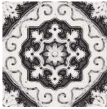
14 6" x 6"