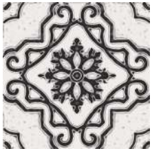
16 6" x 6"