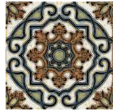
11 6" x 6"