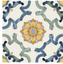
3 6" x 6"