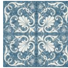
5 6" x 6"