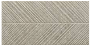
COAST LISCA 24"x48"