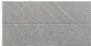
RIVER LISCA 24"x48"