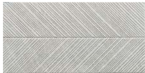
ICE LISCA 24"x48"