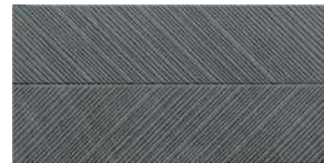
SEA LISCA 24"x48"