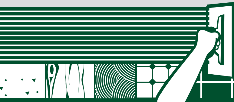
CONCRETE EXTERIOR-GRADE PLYWOOD CUTBACK ADHESIVE RESIDUE EXISTING VAT, VCT AND NON-CUSHIONED VINYL SHEET GOODS EXISTING TILE