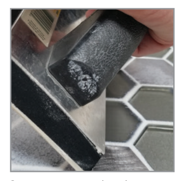
Remove excess grout through successive diagonal passes using the edge of the rubber float held at a sharp 90° angle.