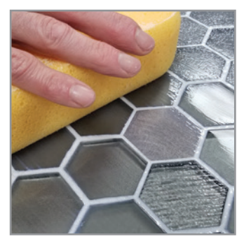
Then, using a slightly damped sponge (not wet), gently wipe excess material from the surface using light and delicate diagonal passes. Change water and rinse the sponge frequently. Keeping the water and sponge clean will achieve better joint color uniformity.