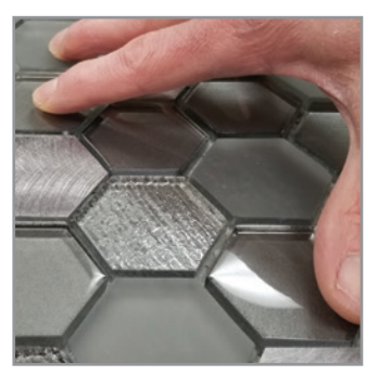
Place tiles firmly with a slight back and forth motion across ridges and tamp tiles repeatedly to achieve at least 90% adhesive contact with the tile back.