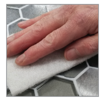
Allow grout to harden for about 20 to 30 minutes. Using a slightly damped white scrubbing pad, loosen up all excess grout over the tile with a circular motion. Do not add water before everything is well loosened up.