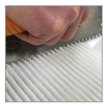
Apply an adhesive layer using the notched side of the trowel ridge in a straight-line directional pattern to achieve an even spread. For walls, maintain ridges running in a horizontal directional pattern.