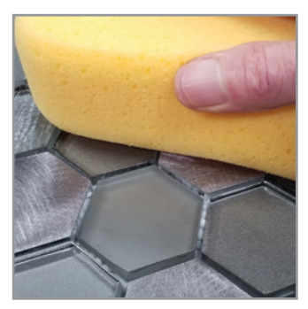
Slightly moisten tile surface with a damp sponge just before application to help with spreading the grout.