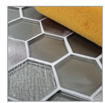
Wait at least 15-30 minutes before removing the final haze from the tile or stone surface with a slightly dampened sponge or a microfiber towel.

Important: Do not let water sit on top of grout joints as it will interfere with the final clean up and curing, thus causing poor results.