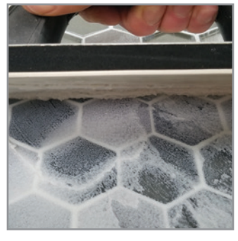
With a firm to medium sharp-edged rubber float, force grout diagonally into the joint at a 45° angle, ensuring that the grout is wellcompacted, free of voids and pin holes, and filled flush with the tile or stone edge.